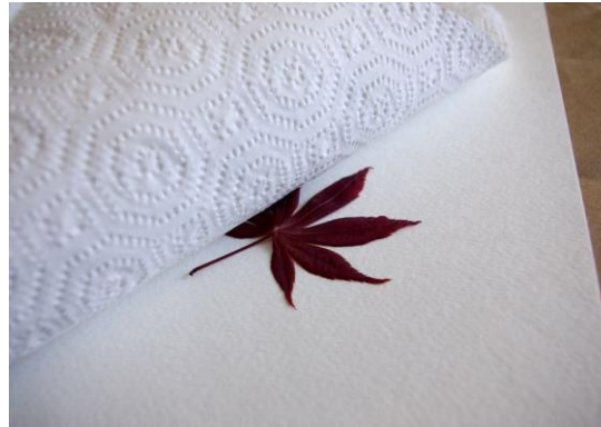
2. Lay leaf or flower on paper