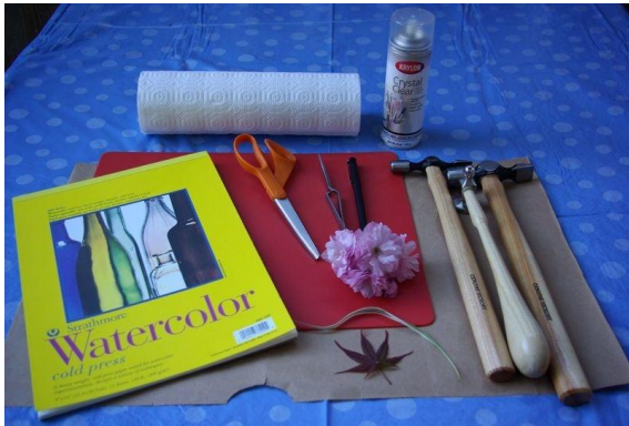
1. Assemble equipment