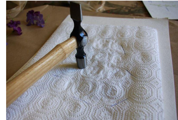
3. Gently tap with hammer