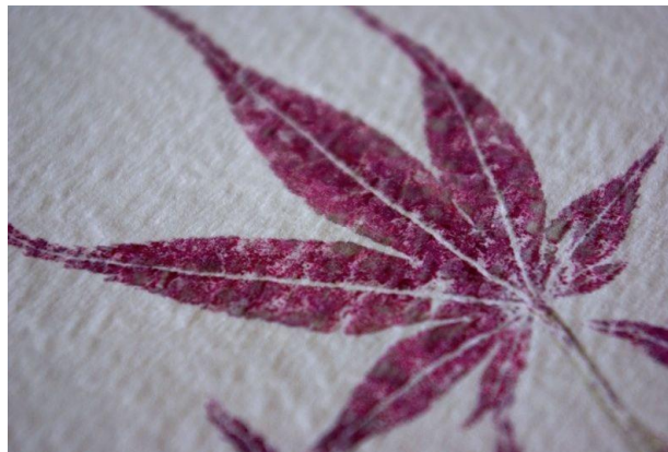
5. Finished product