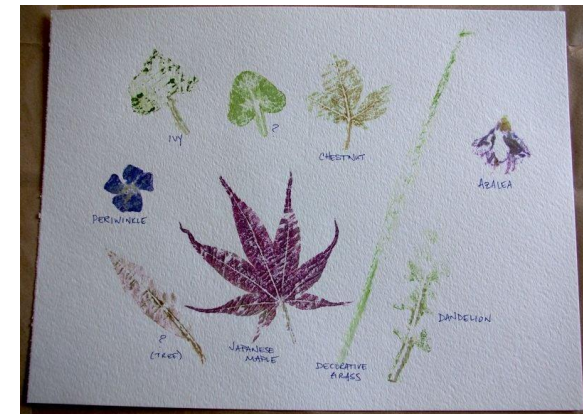
6. Try other leaves & flowers