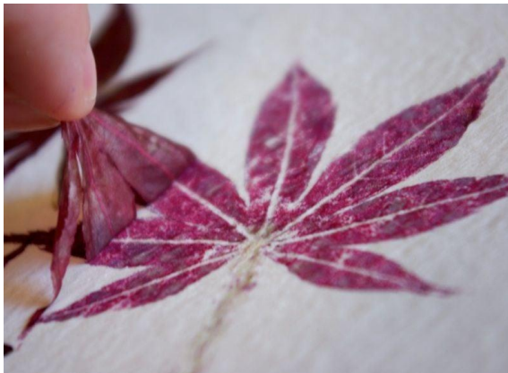
4. Gently unveil